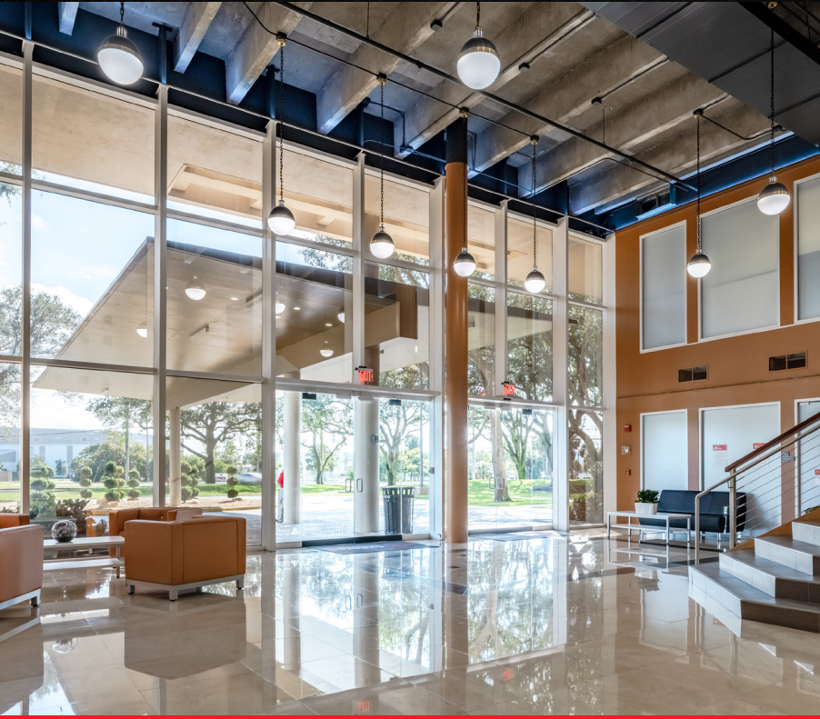
NEW LOBBY & COMMON AREAS