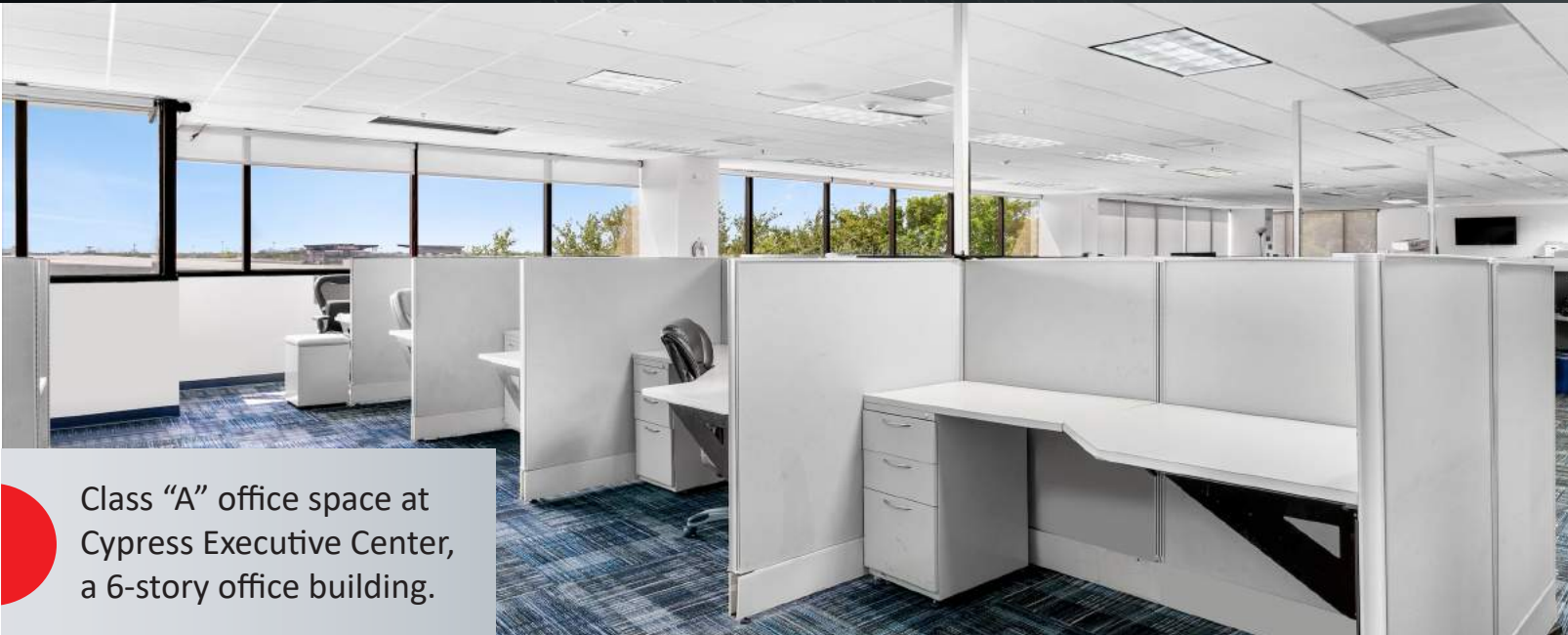
Class "A" office space at Cypress Executive Center, a 6-story office building.